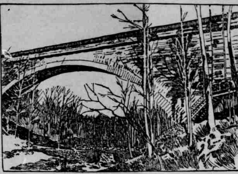
WORLD'S LARGEST SINGLE SPAN STONE ARCH.

Most Unique Structure in Engineering History. Is Linked With the Annals of the Country .. ..