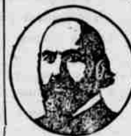
JAMES J. HILL.

By J. J. Hill, President Great Northern Railway.