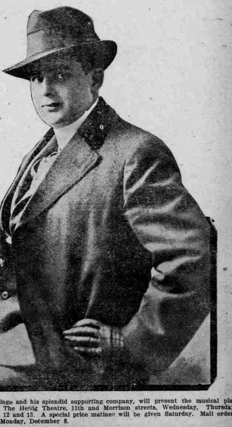
The always popular, Julian Eltinge and his splendid supporting company, will present the musical play success, "The Fascinating Widow," at the Heilig Theatre, 11th and Morrison streets, Wednesday, Thursday, Friday and Saturday, December 10, 11, 12 and 13. A special price matinee will be given Saturday. Mail orders received now. Boxoffice sale opens Monday, December 8.

Livestock, Meats BEEF—(Live weight)—steers 7c; cows 6c; bulls 4 to 6c. MUTTON—Sheep 3 to 4c; lambs, 5 to 5 1/2c. POULTRY—(buying)—Hens 12c; old roosters 9c; broilers 11c.