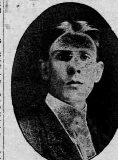
As the County Judge in Tress, with Burroughs-Howland Co. at Bell Theatre, Monday night.