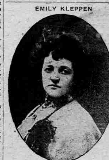
Playing Tress, with Burroughs-Howland Co., Bell Theatre, opening Monday.