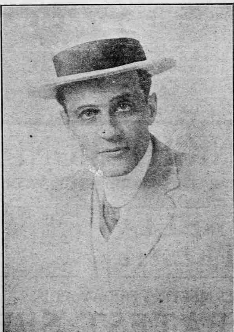
On of the Baker Players in the "Grain of Dust"