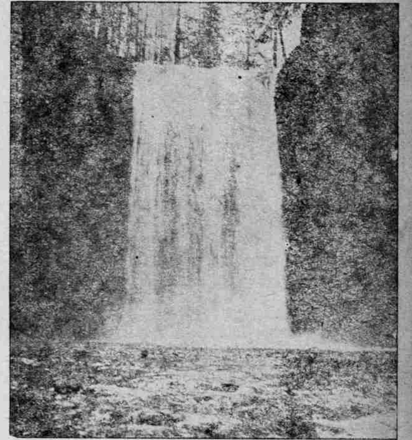
Falls of South Clackamas. Proposed Intake for Water Supply for Oregon City is 1500 Feet Upstream From This Falls

The cloudier the day, the more need to look and be pleasant.