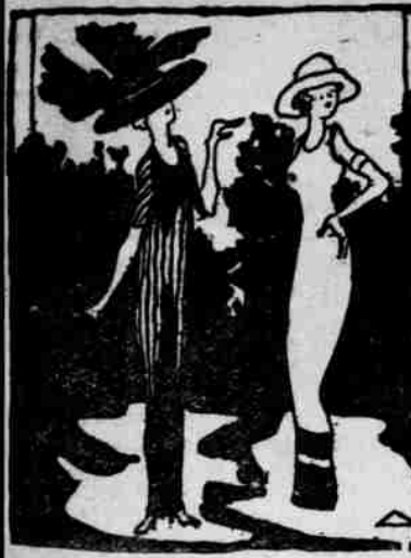
"I'm going to bleach my hair." "Keep it dark!"—Satire.