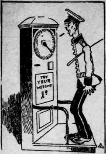
A light infantryman.—Comic Cuts.