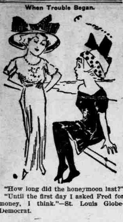
When Trouble Began.