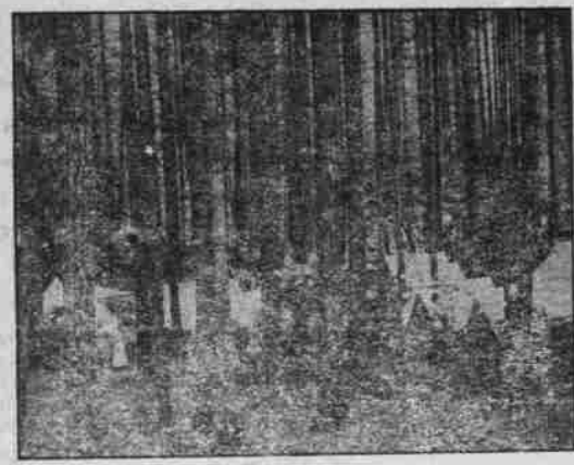
CORNER OF TENT CITY

GREATEST IN YEARS---EVERYBODY WILL BE THERE---MAKE YOUR PLANS TO-DAY---WONDERFUL PROGRAMME