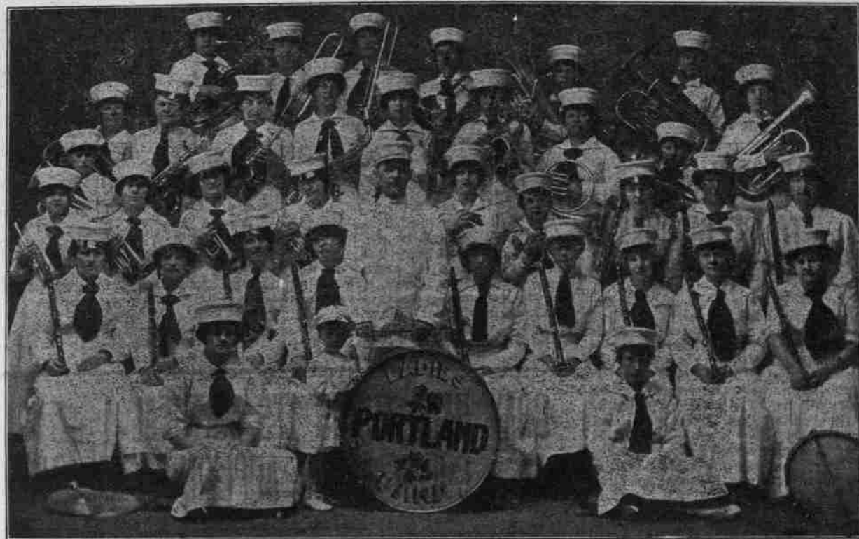
PORTLAND LADIES' BAND—MEMBERS ARTISAN LODGE — EXCEL LENT MUSICIANS—24 CONCERTS