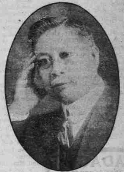
NG. POON CHEW Chinese Statesman-Lecturer