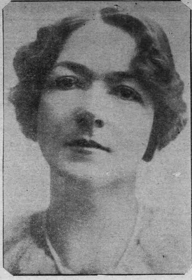
Charles Froham will present the favorite actress, Blanche Bates and an excellent company of players in her dramatic triumph, "The Witness for the Defense," at the Helig theatre, 11th and Morrison streets, for three nights, beginning Thursday, June 19. Matinee Saturday.

In "The Witness for the Defense," the A. E. W. Mason drama which will be seen here at the Helig theatre, Portland, Thursday, Friday and Saturday, under the direction of Charles Froham, Blanche Bates has an unusual opportunity for intellectual as well as emotional acting.