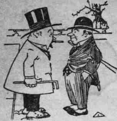
Cudger—Binks has been telling lies about me again. Badger—He might do worse. He might tell the truth about you.—Chicago News