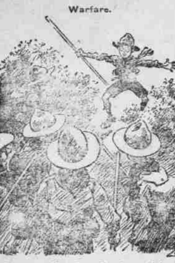
Clarence—I'm the left wing of the invaders, and you are surrounded and captured. Surrender!—London Weekly Telegraph.