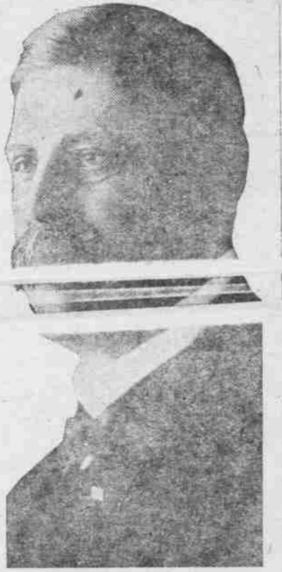
A NEW SENATE FACE Senator John F. Shafer, of Colorado, who succeeds Senator Guggenheim.

Portland has had several women inspectors of this kind for years, and has found that they have done creditable and valuable work. Other cities both in this state and elsewhere, have women inspectors, and it is generally conceded that the work is a valuable asset to the government of any municipality.