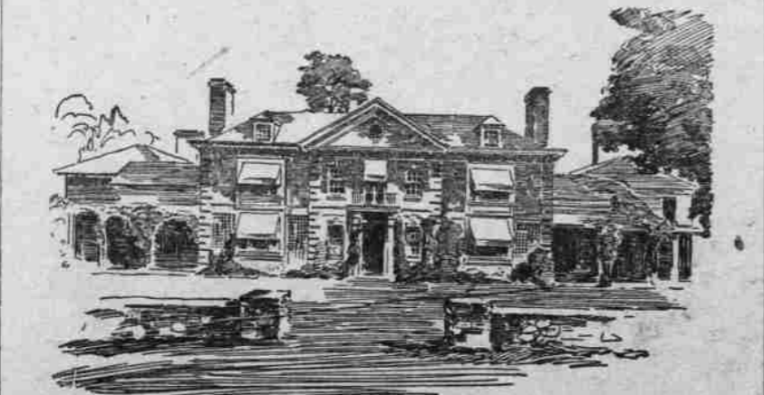
Harlakenden House, the home of Winston Churchill, the novelist, where President Woodrow Wilson will spend the coming summer with his family.