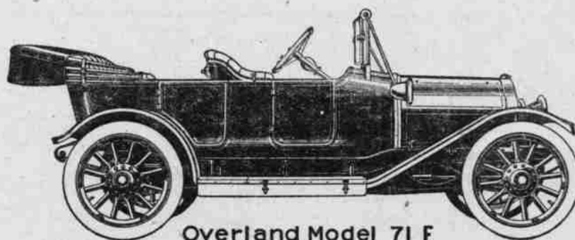
Overland Model 71 F

Motor—Four cylinders, cast single and set off center; bore, 4 in.; stroke, 4 1/2 in.; developing 30 horsepower actual at normal speed. Five-bearing crankshaft. Cooling—Thermo-siphon or natural water cooling system—no pump. Frame—Cold-rolled steel, hot-riveted. Wheelbase—110 inches. Tread—56 inches; for south, 60 inches. Clutch—Cone, leather-faced. Transmission—Selective, sliding-gear type, three speeds; center control; annular bearings. Ignition—Magneto and battery with non-vibrating coil. Lubrication—Splash lubrication for main and connecting rod bearings. Pistons and timing gears lubricated by mechanical oiler. Brakes—New design; contracting and expanding on rear wheel hubs, quick-adjustable. Springs—Semi-elliptic front, three-quarter-elliptic rear; six leaves, steel-bushing eyes. Steering Gear—Worm and gear, adjustable; 16-inch steering wheel. Front Axle—I-beam section, drop-forged in one heat, without welding; Timken bearings. Rear Axle—Three-quarter floating; Hyatt bearings. Wheels—Hickory; artillery pattern; 12 spokes; 12 bolts each wheel. Tires—32x3 1/2 in. front and rear; quick-detachable demountable rims. Finish—Overland blue, gray wheels, black hubs; nickel and aluminum trimmings. Body—Five-passenger touring car. Metal. Equipment—Acetylene engine-starter; gas tank; two gas lamps; three oil lamps; mohair top and top boot; windshield; speedometer; horn; robe rail; foot-rest; wire carriers in rear; etc. Price—$985, F. O. B. Toledo, Ohio.