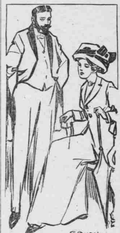
"MISS WHO?" HE ASKED BRUSQUELY.

"There was not a sound except the ticking of the clock and the gentle fall of rain on the tin roof of the porch