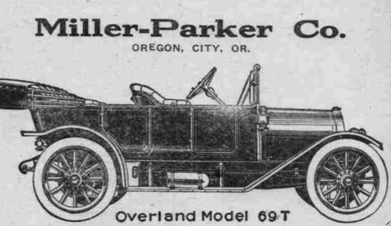
Overland Model 69 T

HIGH PRICED FEATURE No. 3 They have put the very best and most expensive bearings—Timken and Hyatt—into the Overland Model 69 T. They are the same brand as used in $5000 and $6000 cars.