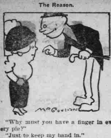
"Why must you have a finger in every pie?" "Just to keep my hand in."