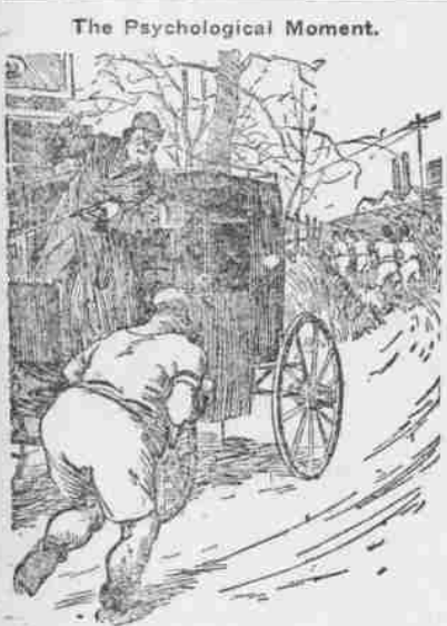
Growler to distressed barrier—Keb, sir?

Phone, call, or write. You will have our immediate and careful attention