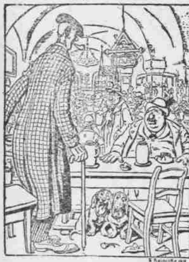
Herr Bierding (as his tall vis-a-vis slowly rises)—Say aren't you going to leave off getting up soon?—Flegende Blätter.