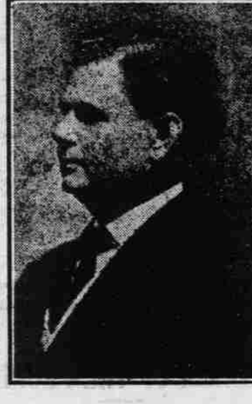
Park Trammell, Governor-elect of Florida.