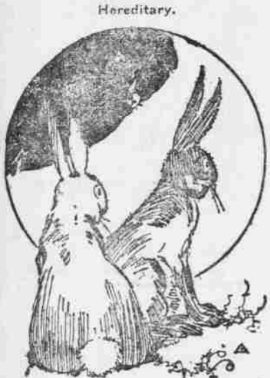
Hereditary. First Bunny - Here comes that grouchy old rabbit. He's too quarrelsome to agree with any one.