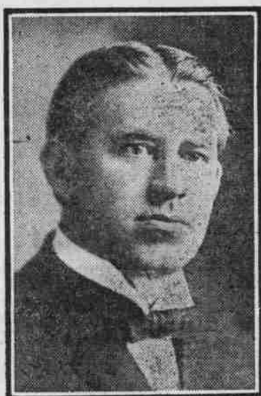
William Hughes, Senator-elect from New Jersey. He now represents his state in the House.