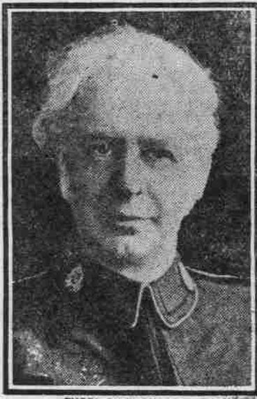
Gen. Bramwell Booth, who succeeded his father as head of the Salvation Army.