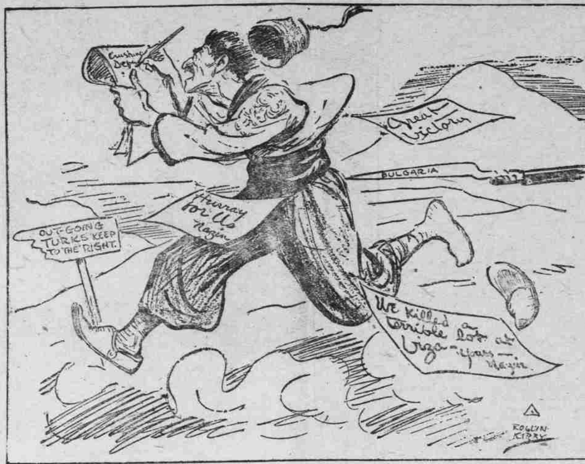
Nazim Pasha encourages his countrymen with statements of complicity.