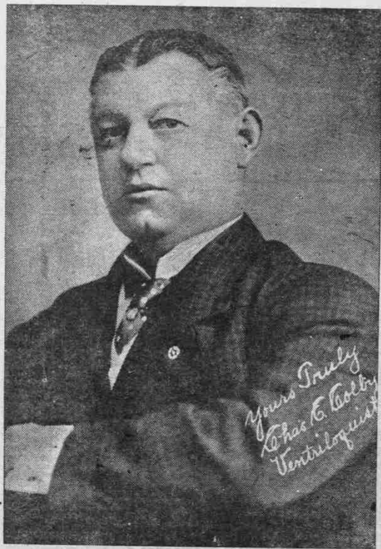
A RIOT AT THE GRAND TWO DAYS

A Princely Gift. Perhaps the most magnificent gift ever made by any individual to any nation was the presentation by Lady Wallace to the English nation of her husband's remarkable art collection in 1897. It contains over 600 pictures of every school, including thirteen by Sir Joshua Reynolds, furniture, china and objects of art innumerable, of a value between $15,000,000 and $20,000,000. It was left absolutely to the nation, the only stipulation being that it should be kept distinct from other national collections.