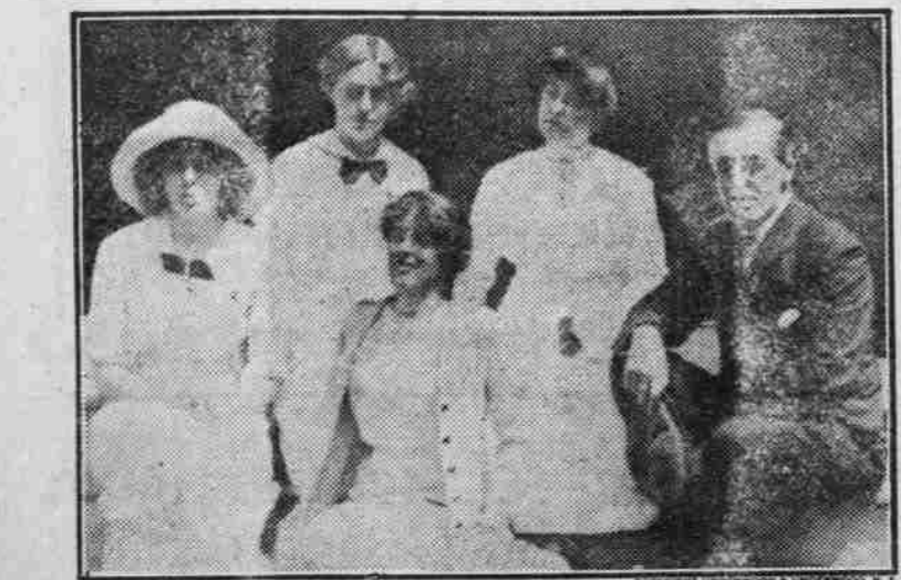
Woodrow Wilson, President-Elect of the United States, wife and three daughters.

A small classified ad will rent that vacant room.