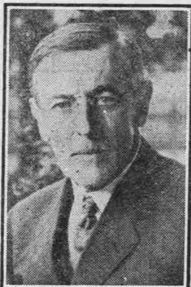
Woodrow Wilson, President-Elect of the United States.