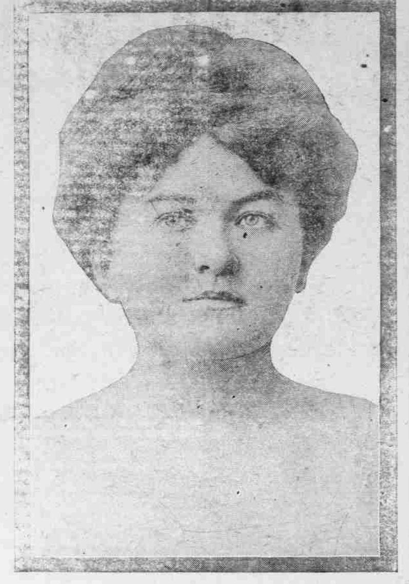
GILBERT AND SULLIVAN FESTIVAL COMPANY AT HEILIG THEATRE

LAST CAR LEAVES FOR OREGON CITY AT MIDNIGHT