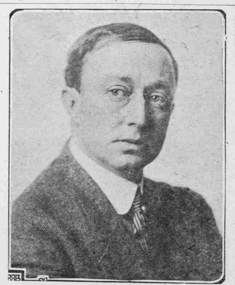
BEVERLY OF GRAUSTARK