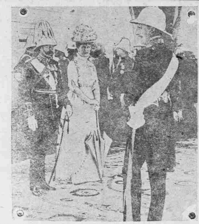
NATURAL COLOR MOTION PICTU RES OF "THE DURBAR" AT HEILIG Scene from "The Natural Color Mot ion Pictures of "The Durbar" at the Heilig Theatre every afternoon a t 2:30 o'clock and every evening at 8:30, beginning Sunday afternoon June 30, for an engagement of 7 days.

LAST CAR LEAVES FOR OREGON CITY AT MIDNIGHT