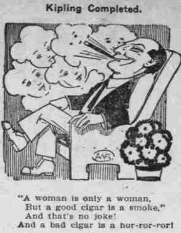
"A woman is only a woman, But a good cigar is a smoke, And that's no joke! And a bad cigar is a hor-ror-ror!"