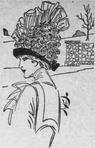
BLACK AND ROSE.

Rather daring in color and style is the hat sketched above. That a striking fashion of this kind should be adopted by a youthful countenance only is needless to say.