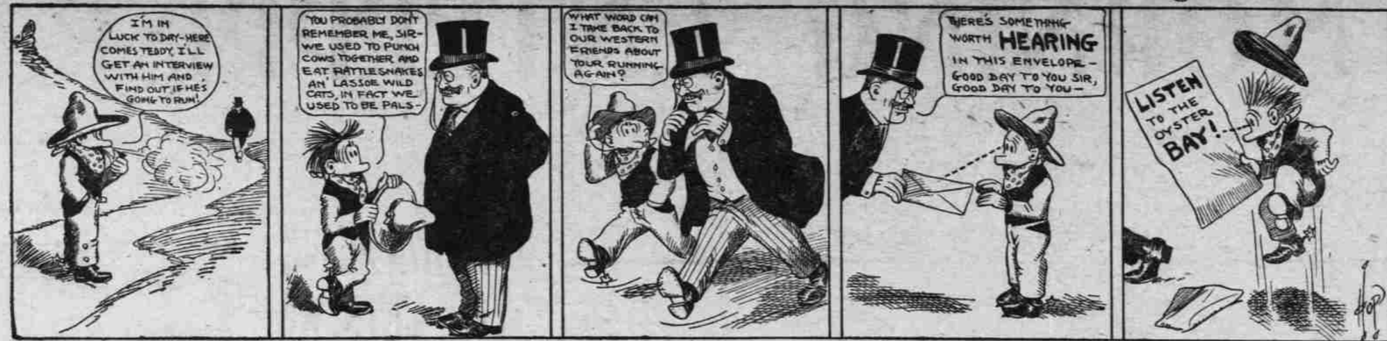
"The Man and The Crowd."

Hear it Sunday evening, May 5, at the CONGREGATIONAL CHURCH