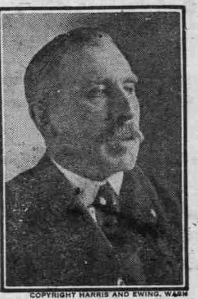
Major General Leonard Wood, Chief of Staff, United States Army.