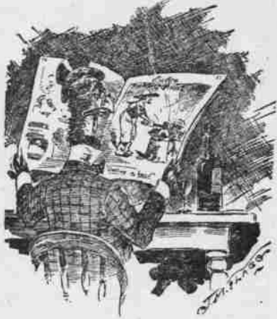
"The truest unkindest cut of all." —Shakespeare.