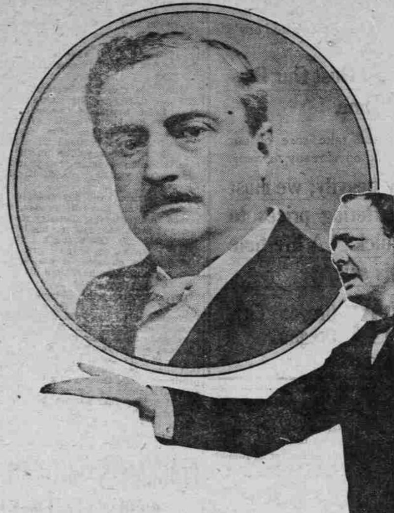
Churchill

A THREATENED outbreak of the old feud between Irish Unionists and Irish Home Rulers on the occasion of Winston Churchill's speech at Belfast on the new home rule measure was averted through a fortunate combination of circumstances. The original purpose of Mr. Churchill was to speak in Ulster hall, the building in which his father, Lord Randolph Churchill, delivered his famous speech opposing an earlier home rule bill, in the course of which he said, "Ulster will fight, and Ulster will be right." Mr. Churchill abandoned this intention, a large force of soldiers was thrown into the city and a steady downpour of rain discouraged any violent demonstration, although the weather did not prevent a great audience of Nationalists assembling in the tent which was pitched for the meeting. Mr. Churchill spoke at length, defining the government program for Ireland, and was supported by John Redmond, who so dominates Irish politics in the British parliament and at home that he is derisively called the "king of Ireland" by his Ulsterite enemies. The first lord of the admiralty (which is Mr. Churchill's official title) will be recognized in our illustration by his characteristic gesture, extending the right arm to its full length. The other photograph is that of Mr. Redmond.