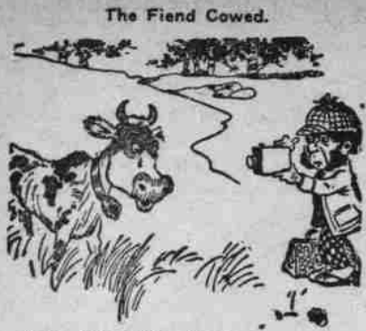
The Fiend Cow. Man—Now smile, please. Cow—Why, what's the joke?