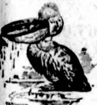
As all fishermen have such luck.