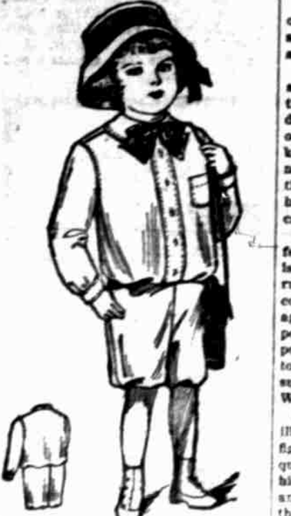
BOY'S SCHOOL SUIT.

Popularity of the New Pierrot Hat. Feather millinery, which always makes its appearance at this time of the year, is more than usually attractive.