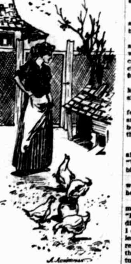
STOOD WATCHING THE TURKEY AND THE BROWN KEEF DOOR.