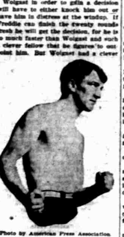
FREDDIE WELCH OF ENGLAND, WHO WILL MEET AD WOLGAST.