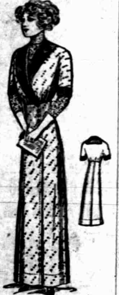
Desirable for street and home wear. In the illustration it is made of fancy silk, with trimming of plain satin and with chemise and undergarments of lace.