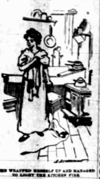
SEE WRAPPED HERSELF UP AND MANAGED TO LIGHT THE KITCHEN FIRE.