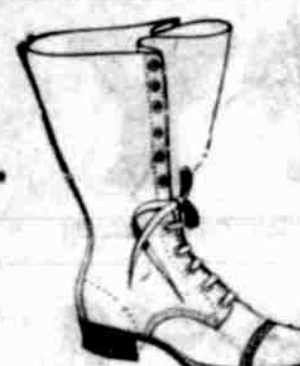
different heights. Quality the