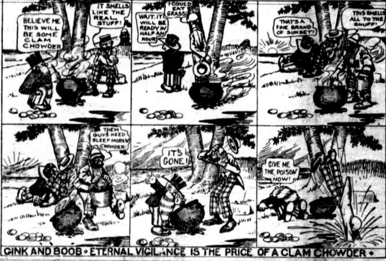
GINK AND BOOB - ETERNAL VIGILANCE IS THE PRICE OF A CLAM CHOWDER