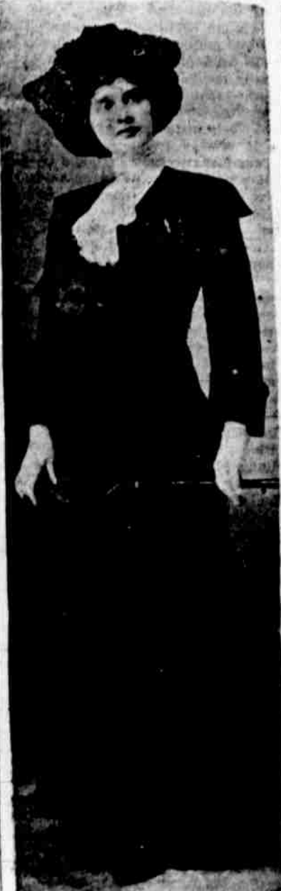
SMART OUTDOOR DRESS.

Braid and Buttons Are Seen on Most of the New Models.