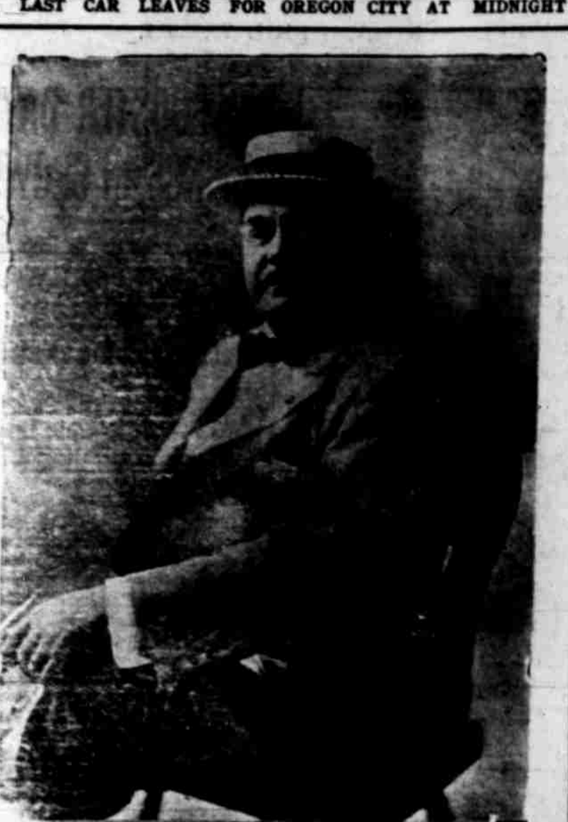
LEW DOCKSTADER AND HIS MINSTRELS AT HEILIG THEATRE. Famous black face artist and his 20th Century Minstrels will be the attraction at the Heilig Theatre, 7th and Taylor streets for three nights beginning Sunday, April 23.

LAST CAR LEAVES FOR OREGON CITY AT MIDNIGHT