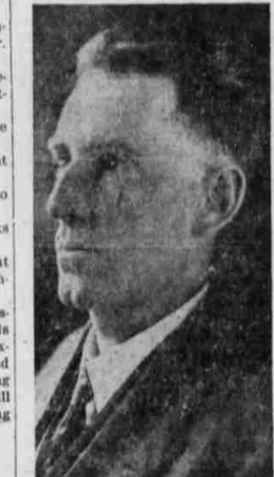
Republican Candidate for County Commissioner

To be a servant of the people and not a political bully.