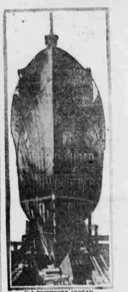
This is the latest destroyer built by the United States navy. The picture was taken before she was launched near San Francisco. It shows how one of these swift vessels looks out of water.