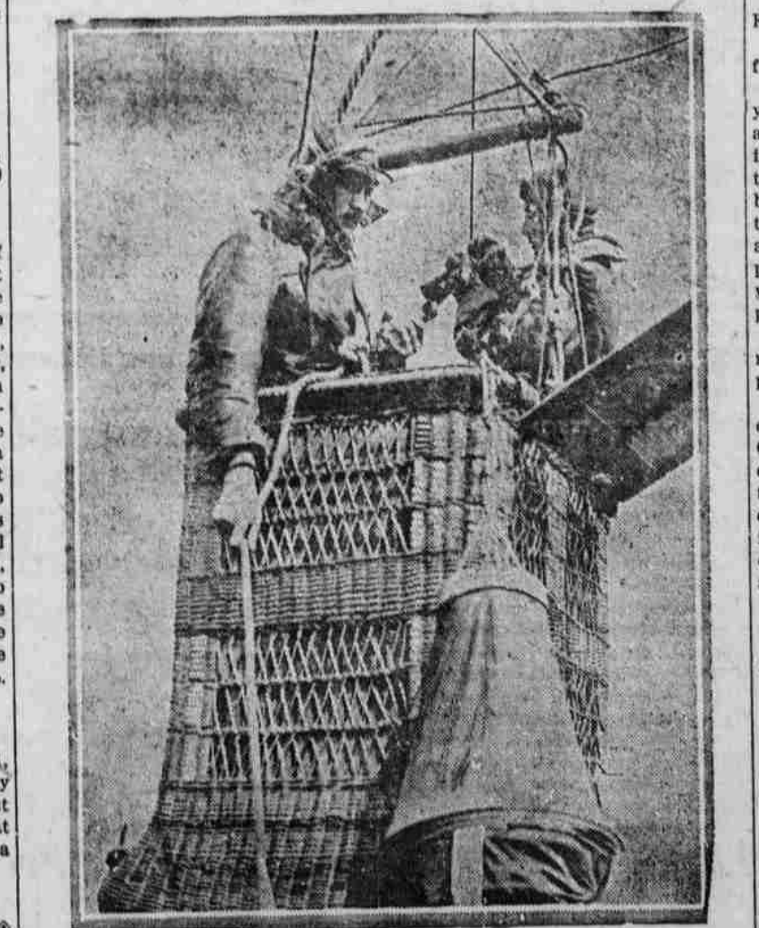
The British Royal Air Force balloons are the eyes of the artillery on the ground. They direct the big guns which hammer the boche lines. Some of the best work of the war is done by the men who go aloft in these baskets. They must often jump with parachutes to save their lives from an attacking airplane.

prayed for in her complaint, to-wit: For a decree dissolving the marriage contract now existing between plaintiff and defendant and for the custody and control of the minor child.