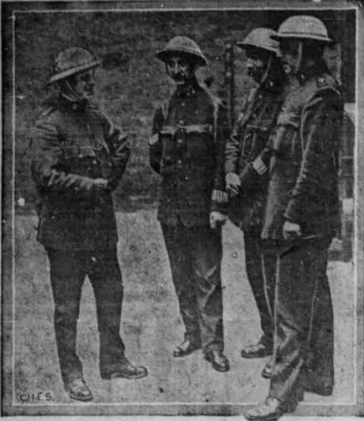
Police in London have been given steel helmets like those worn by British soldiers in the trenches to protect them against bombs from Zeppelins.