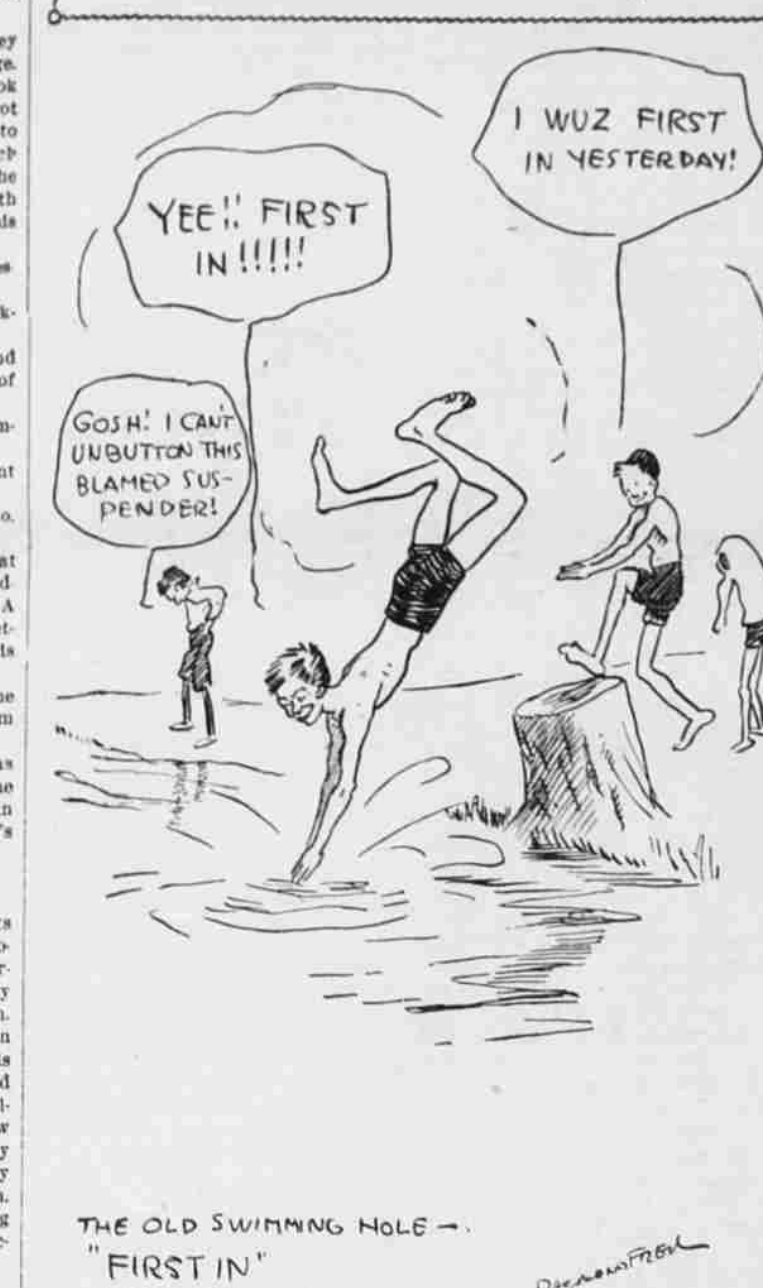
THE OLD SWIMMING HOLE - "FIRST IN"