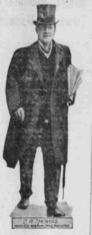
In the accompanying illustration is shown D. A. Thomas, one of the wealthiest men in Wales, who was saved from the wreck of the Lusitania. The photograph was taken in Queens-town, Ireland, where the survivors were landed. Mr. Thomas is a coal baron. He is a former member of parliament and father of Lady Mackworth, who also was saved. He is a close friend of the Marquis of Bute.