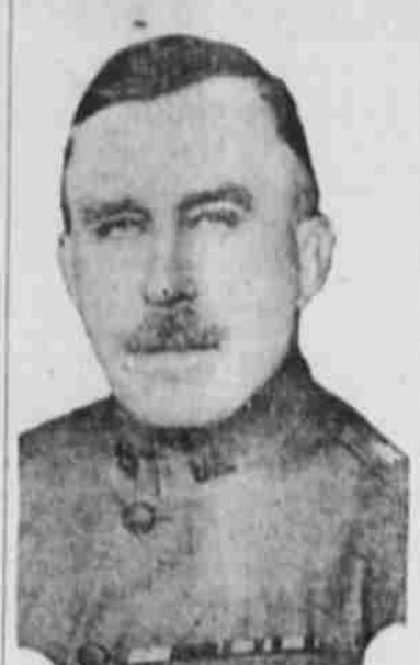
MAJOR GENERAL WOOD CLINEDINST

While it is true that in the event of hostilities with a foreign power the navy would be the most active branch, there would be immediate activity in the army.