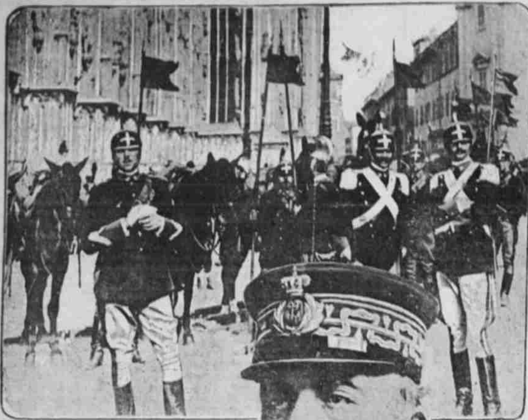
ITALIAN CAVALRY OFFICERS

ITALY, AFTER EXPECTING WAR FOR LONG PERIOD IS IN SPLENDID STATE OF PREPAREDNESS