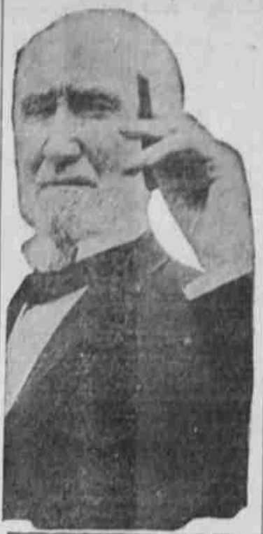
UNCLE JOE CANNON

Former Congressman and Speaker of the House Joseph G. Cannon—the only Uncle Joe—was willing to bet a long black cigar that he could "come back" before the election.