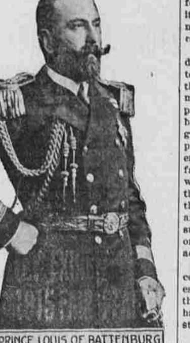
PRINCE LOUIS OF BATTENBURG

Prince Louis of Battenburg, first sea lord of the British admiralty, is under fire because he was once a German. A cry has been raised in England that he be dismissed, it being claimed that his sympathies at heart are with the Germans.