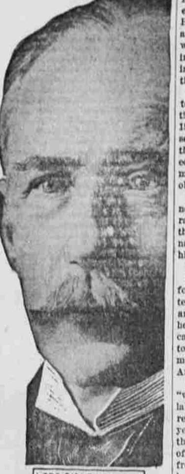
LORD SIDNEY BUXTON

Lord Buxton is governor general of the Union of South Africa. When danger of the Boer uprising became acute he declared martial law.